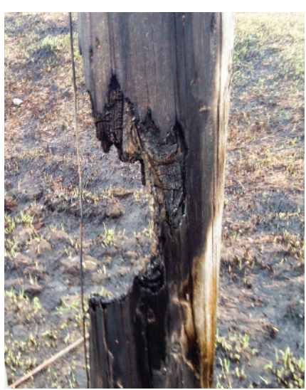
Before burning, check the property for electrical equipment and power poles to avoid damage and potential outages.

tion and weeds at least 4 feet around the base of the pole.